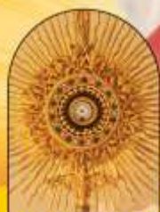
St Faustina's 1st class relic is kept for public veneration at the Divine Retreat Centre